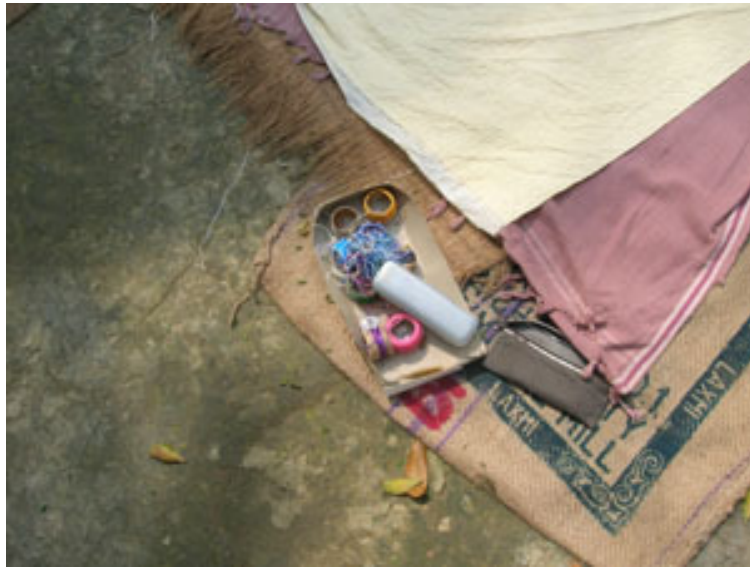
Stitching in the village